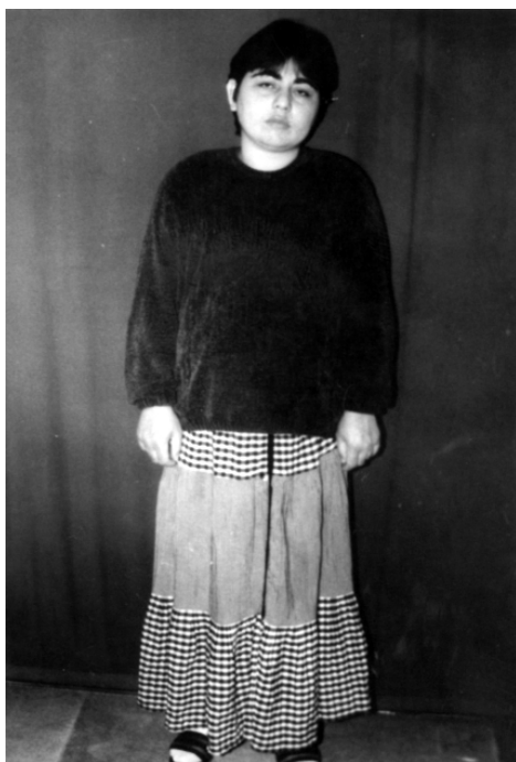
Figure 1. Full-body view of the patient

In her physical evaluation, her appearance was unusual due to the obesity, round face and hirsutismus (Figure 1). Her pulse rate was 96/min, blood pressure was 140/80 mmHg, height was 1.51 cm, and weight was 66 kg (body mass index: 28.95). Her thyroid examination revealed diffuse hyperplasia. She had bilateral cataract in her eyes. Her external genital organs were normal in appearance.