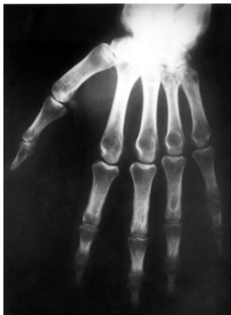
Figure 2. X-ray of the hand showing short metacarpi

In her radiological investigations, it was observed that she had short metatarsi and metacarpi but no subcutaneous ossifications in her hand and foot graphics (Figure 2). In her thyroid ultrasound scan, bilateral hypoechoic nodules and calcifications were found. EEG was normal. CT showed extensive bilateral symmetrical calcifications in the basal ganglia, thalamus and cerebellum (Figure 3). Her cytogenetic investigation was normal.